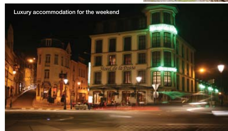
Luxury accommodation for the weekend