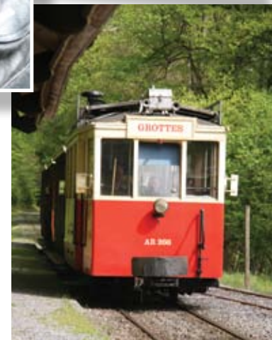
Tram ride to the caves