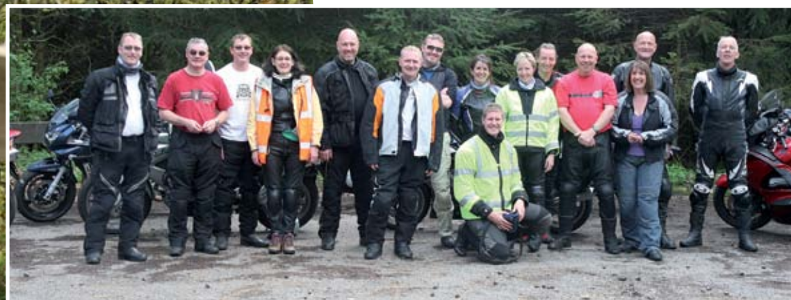
The CADAM (and guests) roll call.